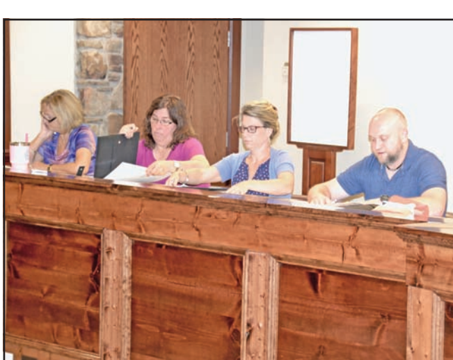
The Hiawassee City Council during its June 5 regular city